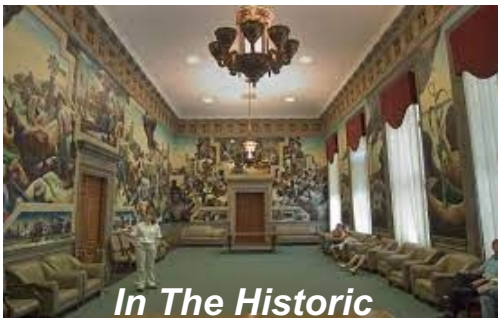
In The Historic Thomas Hart Benton Room