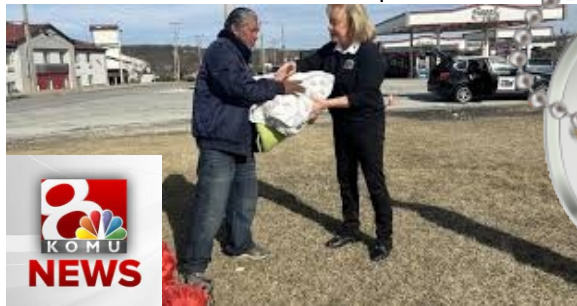
The USTF's Blankets for Vets & Pets Program provided 300 blankets to area Mo homeless and shelters.