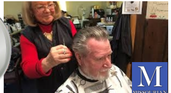
Free haircuts were given to veterans on Valentine's day, as a way of showing our respect and appreciation of their service. Veterans and their pets received "valentines"