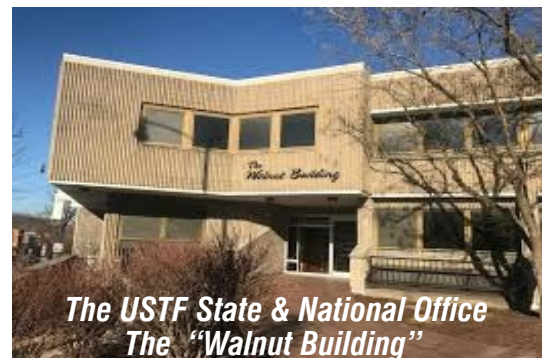
The USTF State & National Office The "Walnut Building" 1001 E. Walnut, Ste 200

The new home of the USTF was dedicated on December 30th 2019 with fanfare and news. "The West Wing" is occupied by the USTF and came just in time to serve as the HQ for the USTF's "Mask A Vet" statewide program housing over 100,000 masks at its peak. It also contains our "Hall of Presidents Letters", Governors Proclamations, along with letters from SECNAV, Army, Air Force & Coast Guard, & Boone County Proclamations Note ~ The USTF Annex is at 25 N. 10th St.