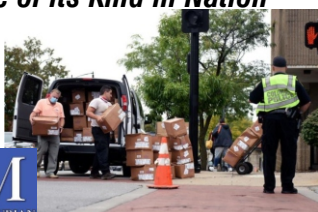
COMO Police stop traffic as the first of over 200,000 masks arrive from SEMA at USTF State & National Office.

During Covid, the USTF provided FREE 194,000 masks to Missouri Veterans, Guard members, families. 54,000 veterans were helped. 20,000 masks went to the under served Black Veterans of KC! This was part of the Gov. support of vets during Covid. USTF worked with DHSS and MSHP.